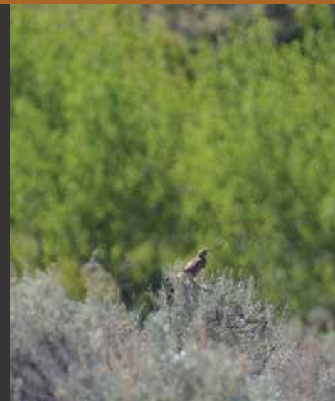
Above: Sage Thrasher