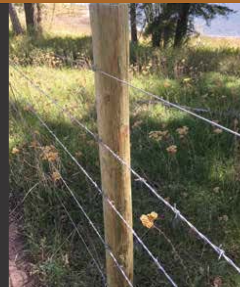
Above: Riparian Fence