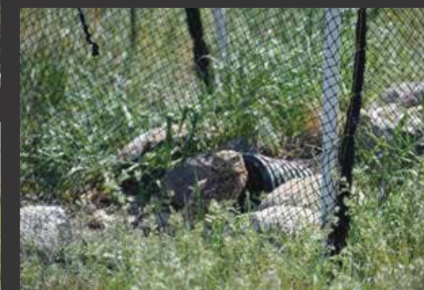
Above: Burrowing Owl