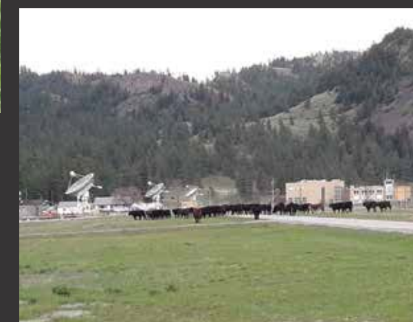
Above: Dominion Radio Astrophysical Observatory at White Lake